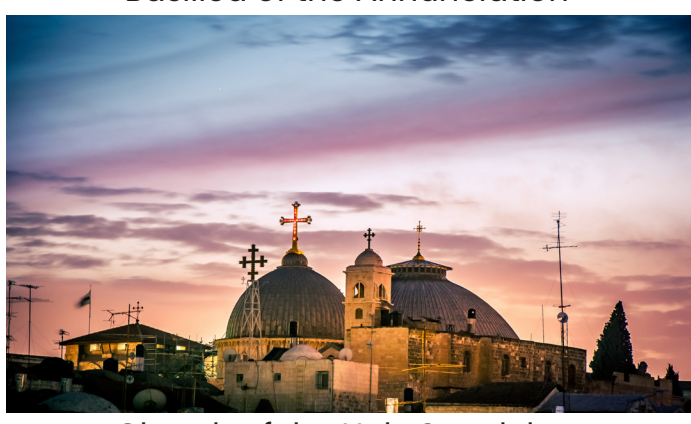
Church of the Holy Sepulchre