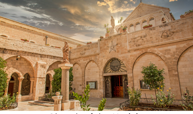
Church of the Nativity