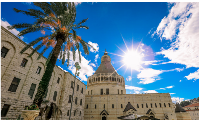
Basilica of the Annunciation